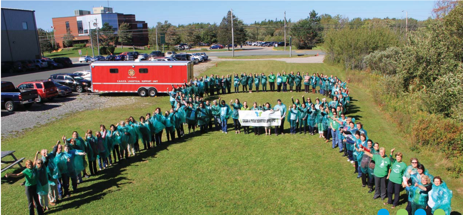
Human Organ and Tissue Donation Ribbon – September 2014 Conference in Sydney Nova Scotia